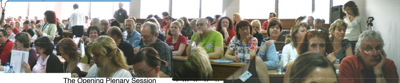
The Opening Plenary Session